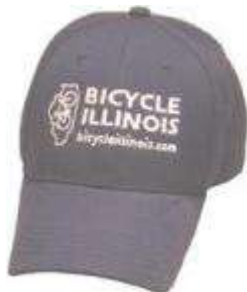
Bicycle Illinois Baseball Hats - $16.99 ea.