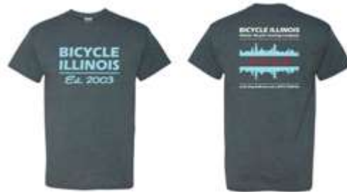
Extra Bicycle Illinois T-Shirts