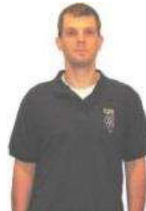
Bicycle Illinois Polo Shirts